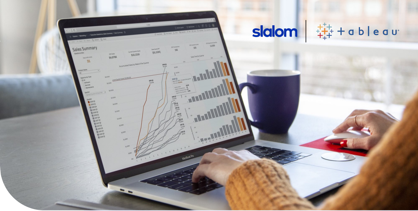
Tableau Cloud Migration Accelerator

As organizations continue to modernize their data platforms by migrating to cloud technologies, Tableau has rolled out Tableau Cloud and is encouraging customers to embrace their SaaS offering. Slalom has developed an accelerator to help clients migrate from Tableau Server to Tableau Cloud with a fast and cost-effective process.